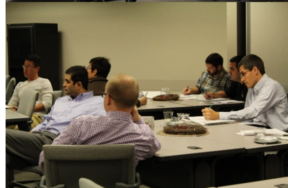
Research Open House Meeting (October 2014)