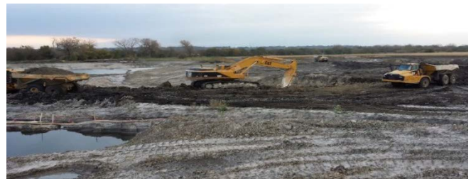
Site-level monitoring of excavator and three haul trucks to evaluate cycle time efficiency