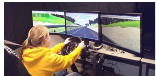
ZouSim simulation of rural high-speed roadways

J-turns have been shown to improve safety on Missouri highways by reducing overall crashes by 34.8% and injury and fatal crashes by 53.7%. They are a type of alternative intersection design that could see greater implementation in Missouri. Because formal design guidance is limited, a number of J-turn design considerations require investigation, including acceleration/deceleration lane configuration, U-turn spacing,