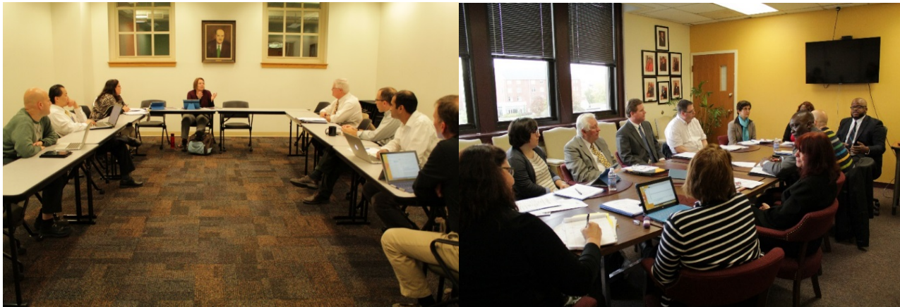
Meeting at the Harris-Stowe State University, University of Missouri – St. Louis, and University of Missouri-Columbia.

Three site visits to our partners were completed in October 2014. We visited the University of Missouri-Columbia on October 29, 2014, Harris-Stowe State University on October 30, 2014, and the University of Missouri-St. Louis on October 30, 2014. Each institution provided a tour of the facilities, gave an overview of its MTC Program, provided research presentations, and held meetings with other faculty members, administrative staff, and students.